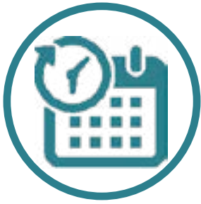
Book an Appointment

Public health measures to help you access the flu shot safely: