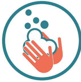
Use Good Hand Hygiene