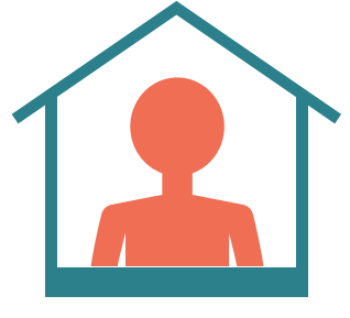
Stay Home if You're Sick

Note: Physician or Nurse Practitioner offices can also provide the flu shot.