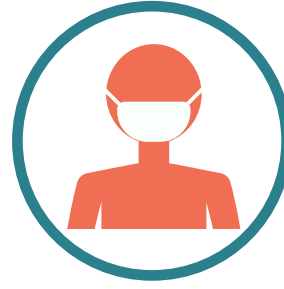
Wear a Face Mask (or Covering)