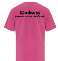
PRIMARY "BE KIND" (BACK)

Many thanks to all who purchased ICRPS Kindness T-shirts and contributed to VON's Kids' Circle! For ICRPS staff and families who purchased shirts, they will be distributed at school once they arrive, which should be within the next few weeks. Community supporters will be emailed directly to receive instructions for pickup.