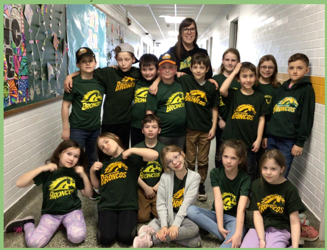
March Theme Days Our Bronco Theme Day and Rock Your Socks were lots of fun this month.