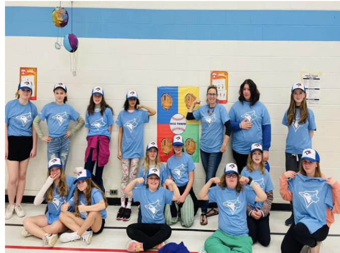
Girls at Bat program got their new shirts and