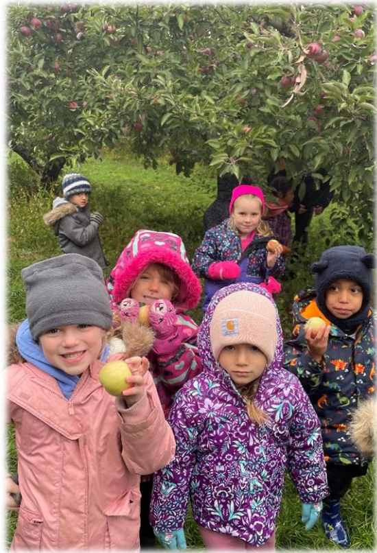
Kindergarten Fieldtrip to Zekveld's