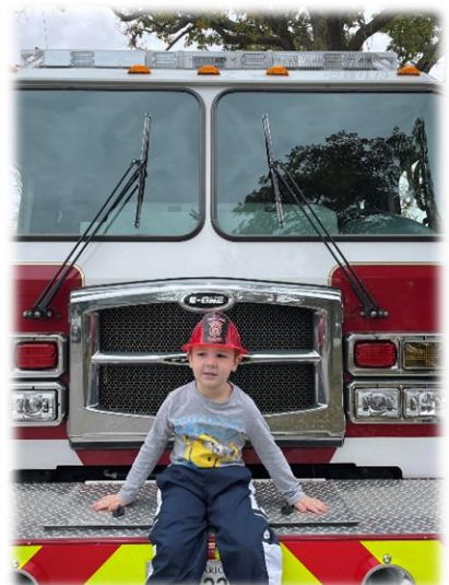
Kindergarten Visits from Sarnia Police AND Sarnia Fire & Rescue