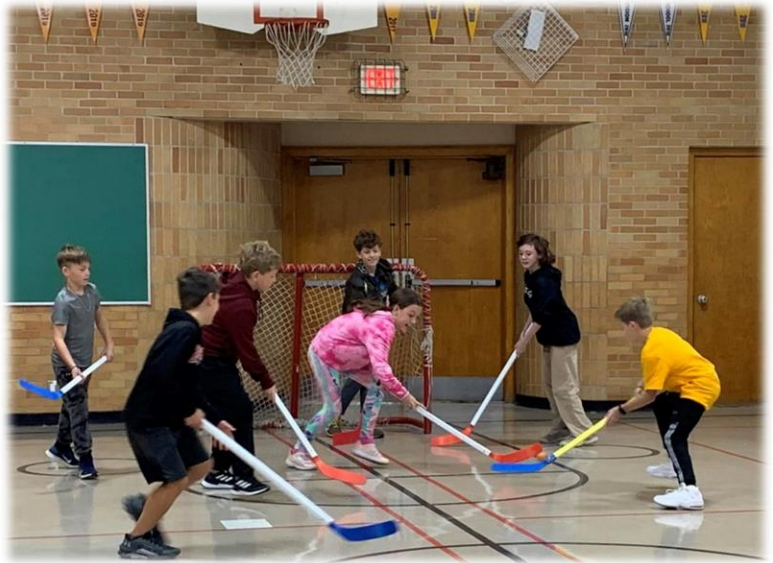
Intramural Floor Hockey