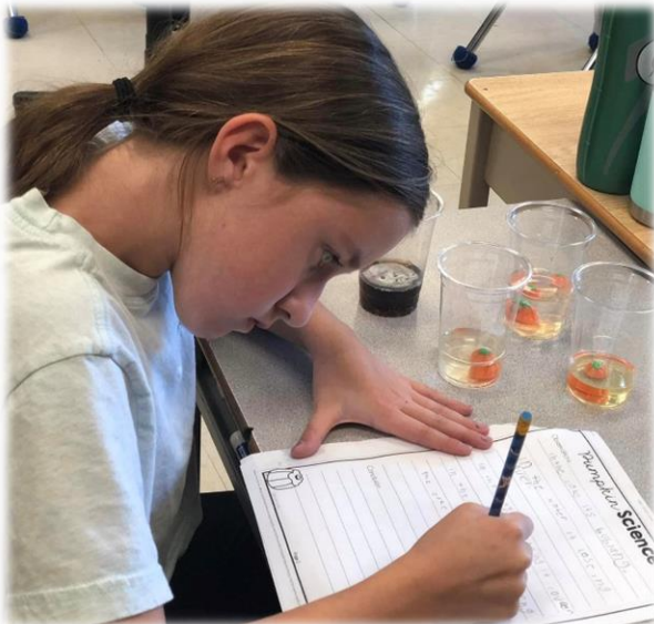
Halloween Science – Dissolving Candy