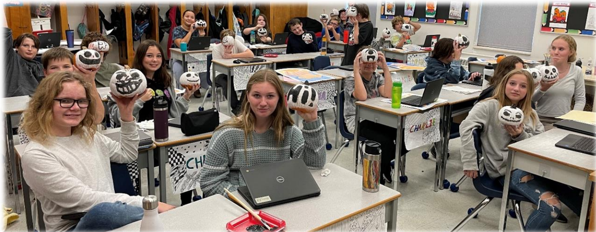
Thank you for our pumpkins, School Council!