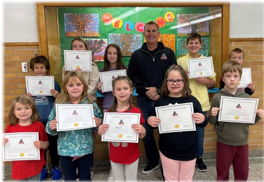
October Character Award Winners - "Empathy"