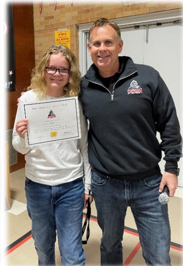
Knight Award Winners – Recognized for hard work and perseverance and/or kindness.