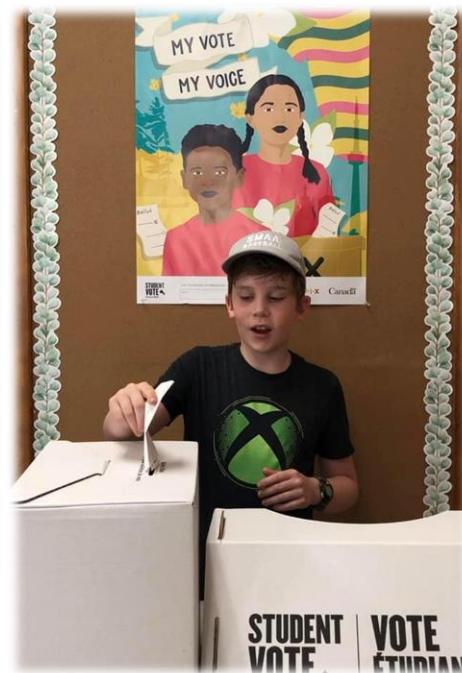
Grade 4-8 marked their ballots, experiencing democracy firsthand