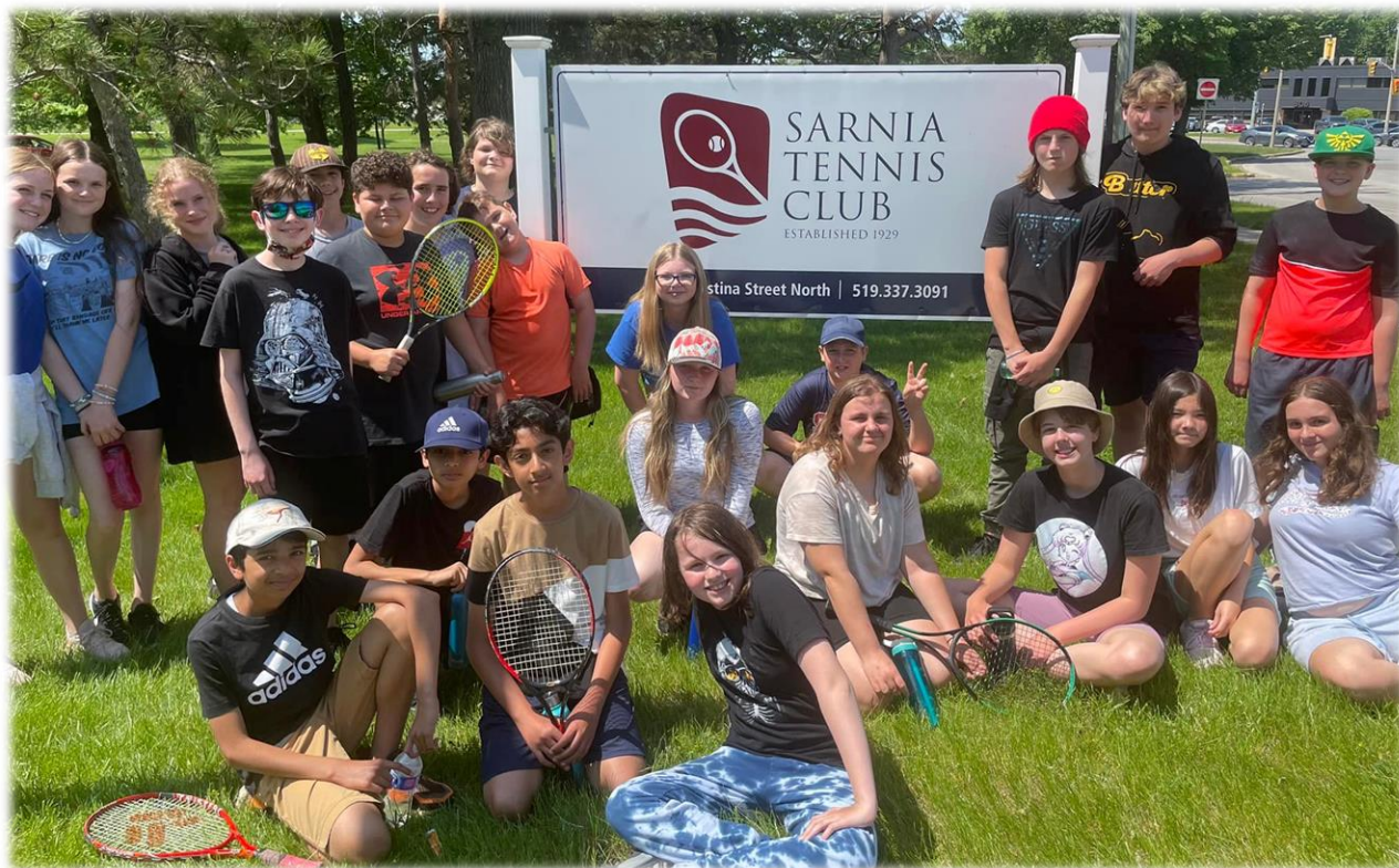
Intermediate students hit the courts at the Sarnia Tennis Club