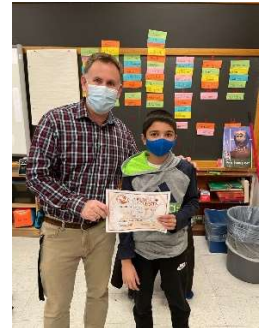
Om (Gr. 7)