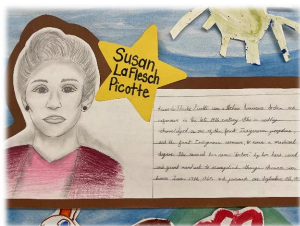
A whole-school collaboration - Go Show the World: A Celebration of Indigenous Heroes