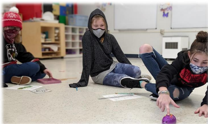
Coding in the Learning Commons