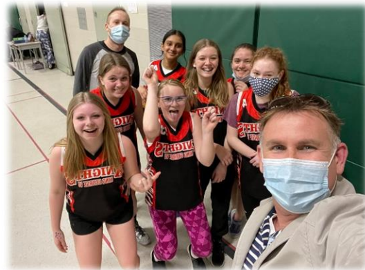
Girls' Basketball Team