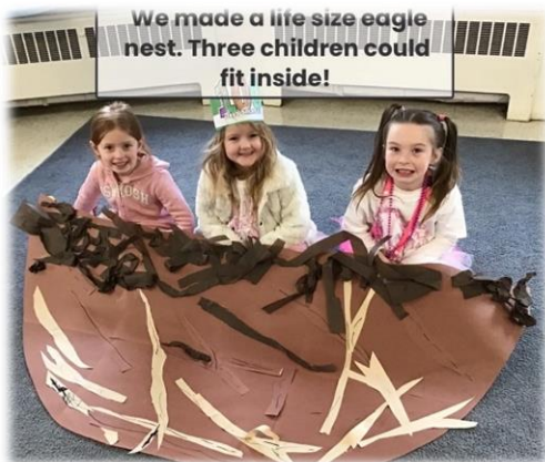
Learning About Bald Eagles in FDK