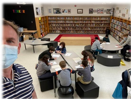
Inaugural Math Enrichment Club