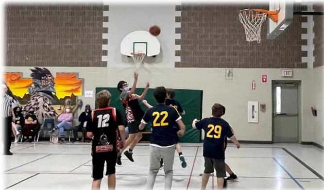
Boys' Basketball Team