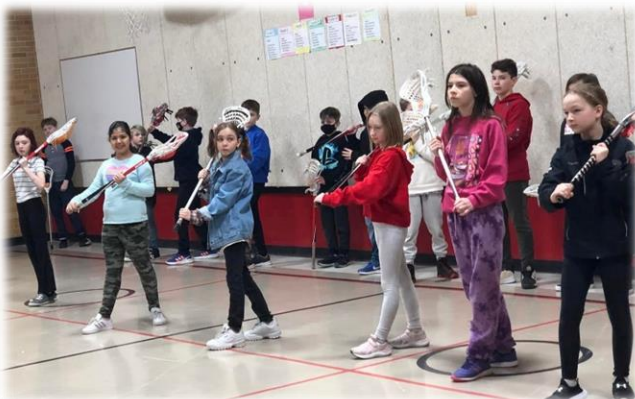
Make Your Mark Lacrosse Instruction